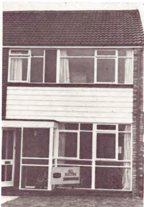
MANWEB's "all-electric" show house on the Woodlands Estate, Liverpool.